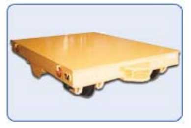
Non-Powered Transfer Car 15 Ton Capacity